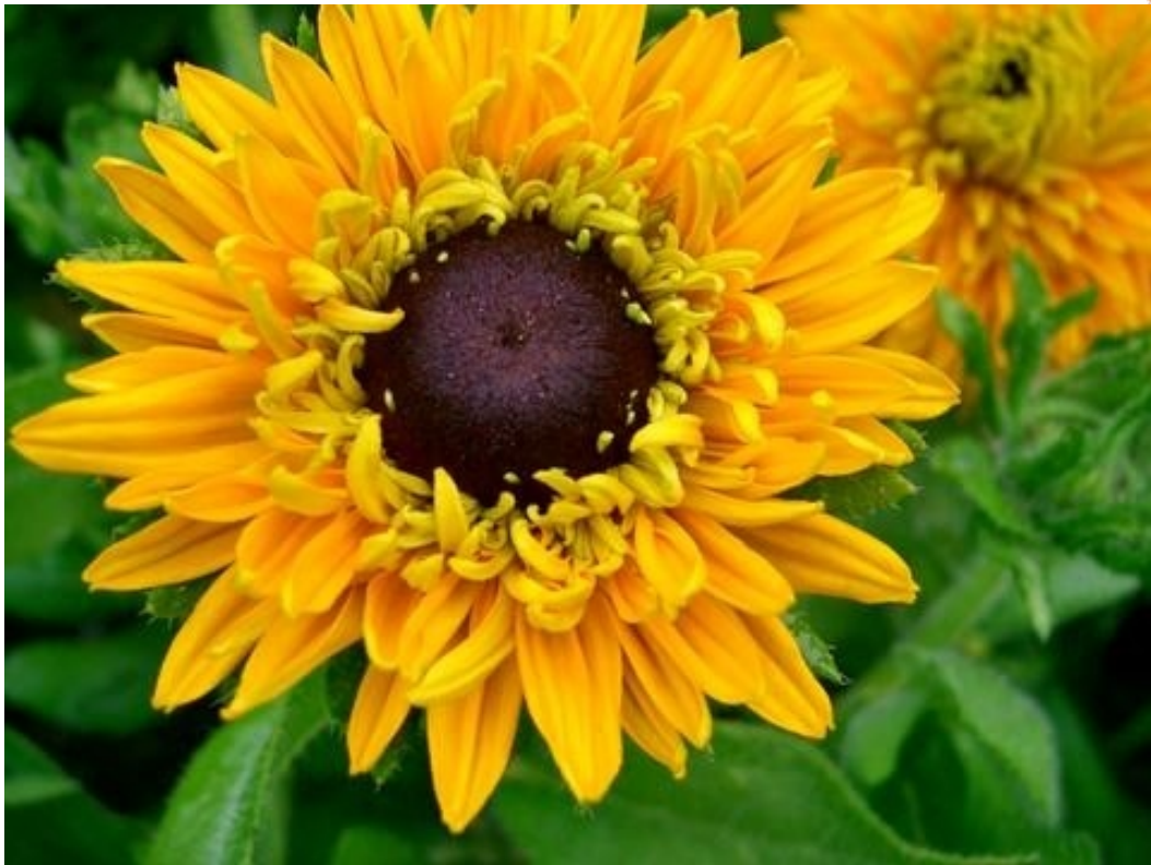
"Natural Abundance" by Clay & Sandya